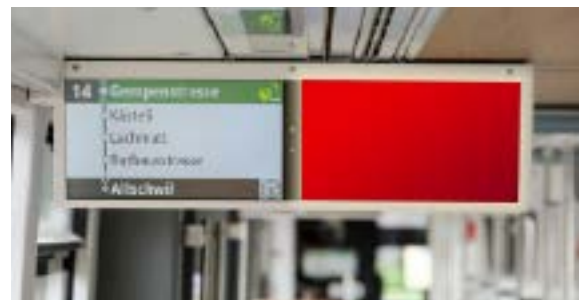
BVB Basler Verkehrs-Betriebe (City Kanal Basel)