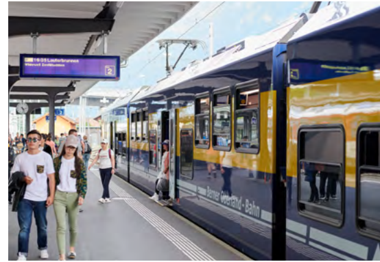
Berner Oberland Railway