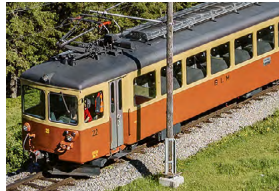
Lauterbrunnen - Mürren Railway