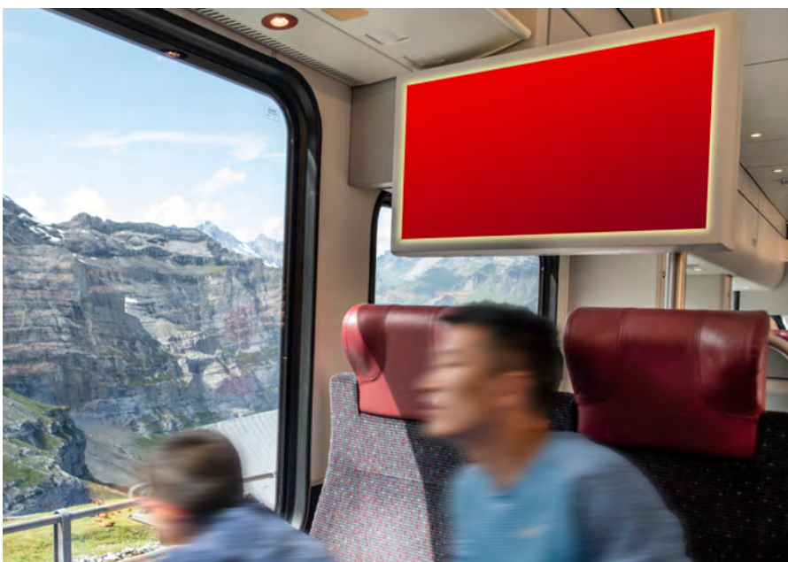
TrafficMediaScreen Jungfrau Railway

Basic: General Terms and Conditions of APG|SGA apply Information provided without guarantee, offers and prices subject to change