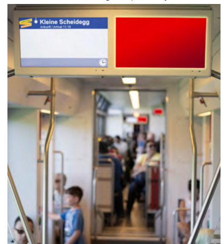
TrafficMediaScreen Wengernalp Railway

traffic.ch/produktion/tms-produktionsangebot/