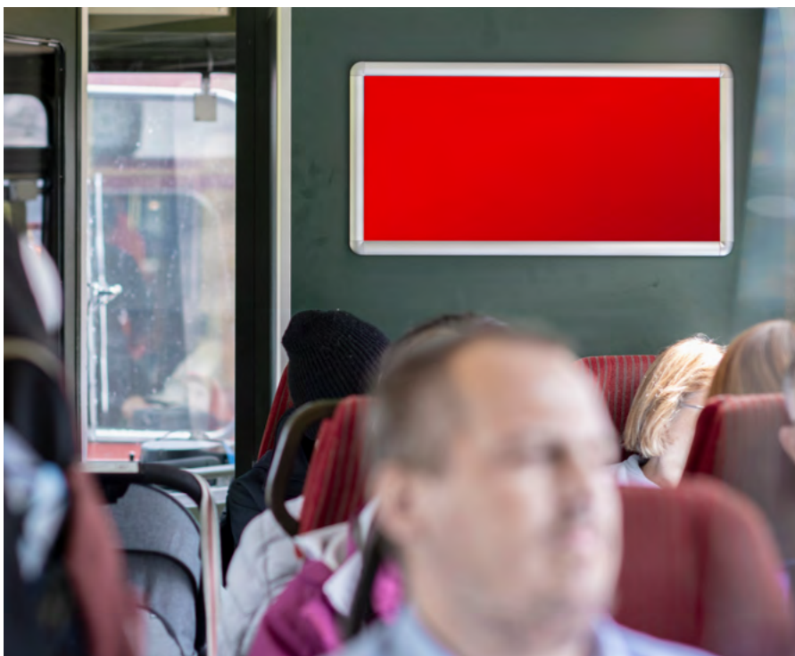
RailPoster Jungfrau Railway