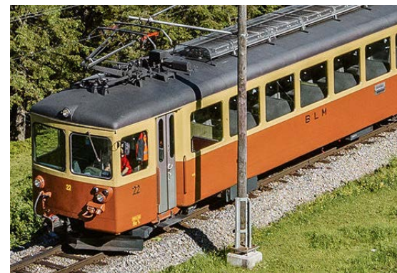
Lauterbrunnen - Mürren Railway