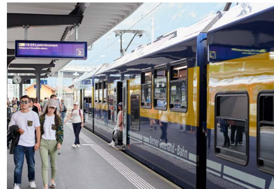
Berner Oberland Railway