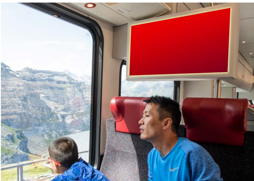
TrafficMediaScreen Wengernalp Railway

Basic: General Terms and Conditions of APG|SGA Traffic apply Information provided without guarantee, offers and prices subject to change