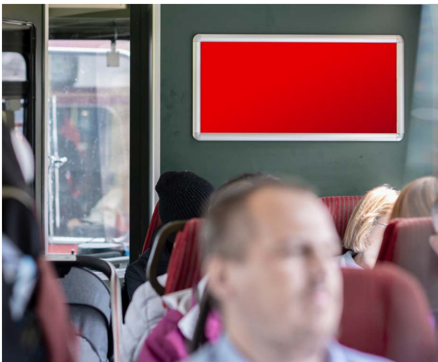
RailBoard Jungfrau Railway